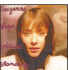
Suzanne Vega Solitude Standing (A&M)

Veteran singer songwriter has existed on a lower tier of popularity than contemporaries like Sara McLachlan and Alanis Morissette, despite the fact that she often has more to say, and says it better.