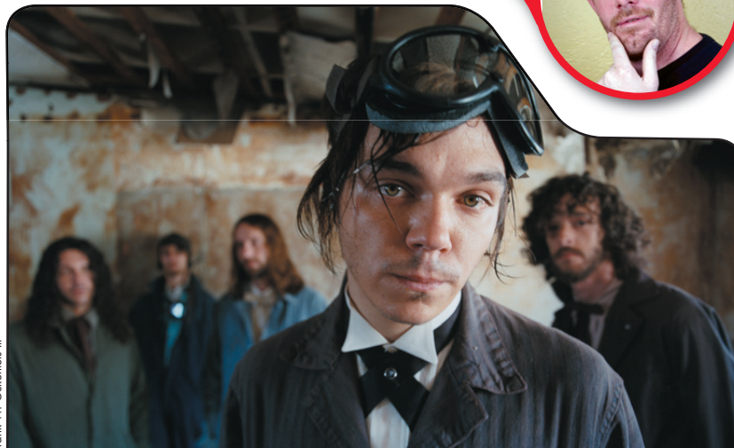
Didn't you hear? Goggles are the next big thing.