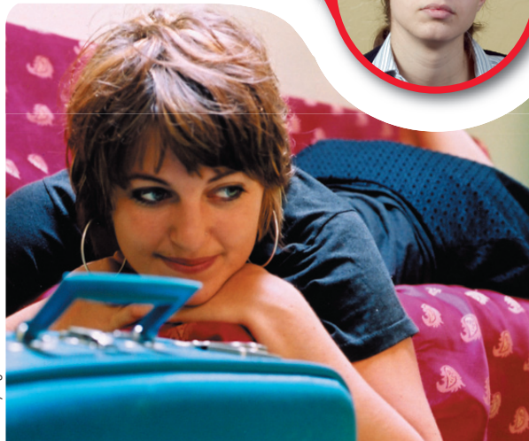
Meet the first babe signed to Righteous Babe Records since Ani DiFranco.